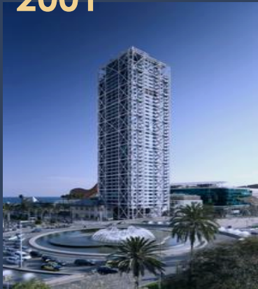
Acquired Hotel Arts