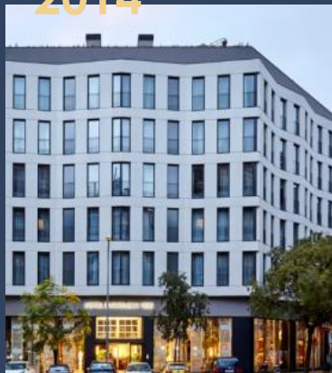
Launched Meridia II (RE) Exited Meridia I (Hospitality)