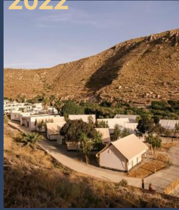
Launched Meridia Glamping Program