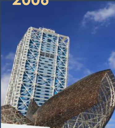
Sold Hotel Arts