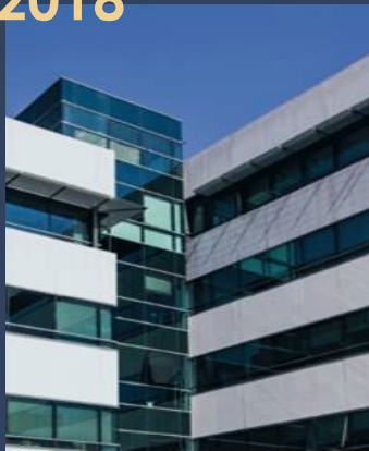
Agreement Franklin Templeton SIF