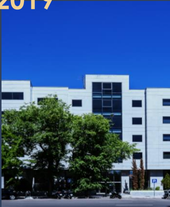
Partnership with Partners Group AG Launched Meridia IV (RE)