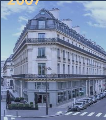
Launched Meridia I (Hospitality)